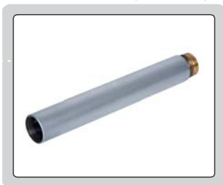
extension rod (included)