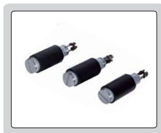
50mm replaceable measuring jaws(included)